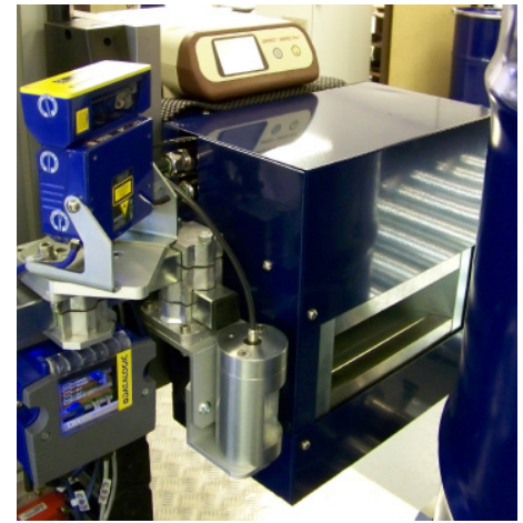
Built-in Geiger-Müller dose rate sensor and waste drum barcode recognition